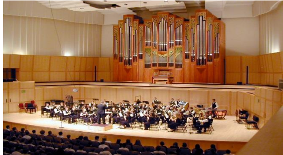
MRJH Symphonic Band at State Jr. High Band Festival

The Symphonic Band is Mountain Ridge Junior High's advanced eighth and ninth grade performing ensemble. Placement in the Symphonic Band is determined by audition. Symphonic Band is treated as an honors class, so expectations are very high. Members are required to attend sectionals and occasional before/after school or evening rehearsals prior to performances. Prerequisites: instrumentation needs, audition and the ability to play all 12 major scales memorized at a steady tempo and a two octave Concert F Chromatic Scale. There is a $25 class fee to help offset travel, festival, equipment and supply costs.